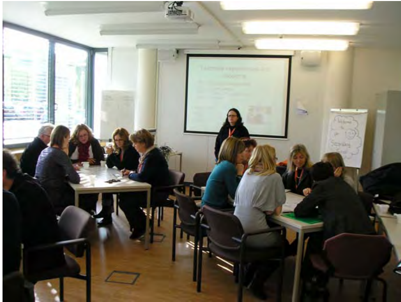
The Secondary school teachers' group

The Secondary School teachers group formulated the following "wishing list":