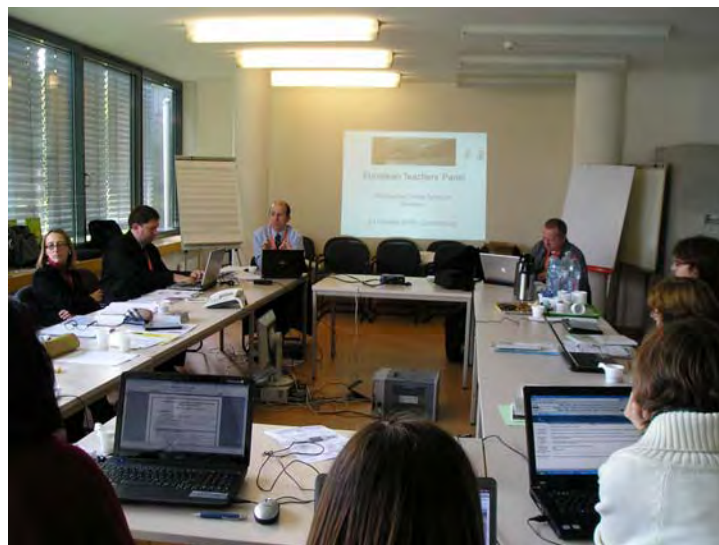
The Primary school teachers' group

The Primary school teachers group discussed as well to what extent Online Safety is included in the curriculum and it is currently being taught at school.