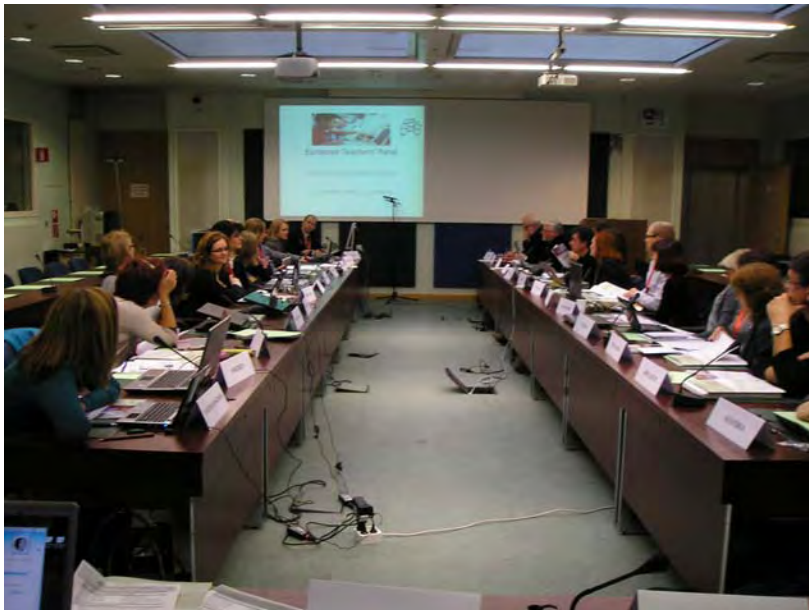
Plenary session of Teachers' Panel

The full agenda of the meeting is available in Annex I.