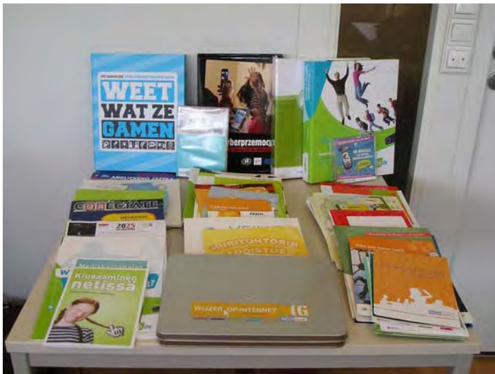
Example of material for schools produced by awareness centres